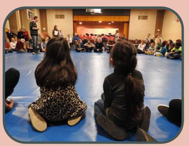
Two Harmony students listen eagerly to UWP students during a circle discussion.