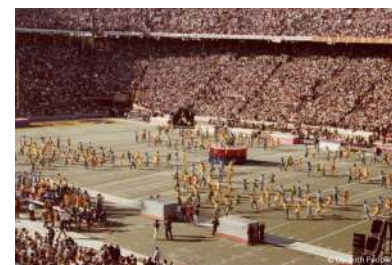
UWP performed in its first Superbowl halftime show during Superbowl X in Miami, Florida in 1976.