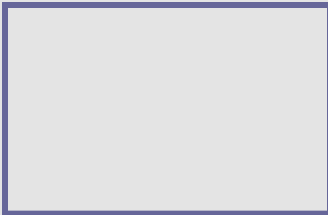
An example of a Scholastic Books "Reading Oasis" can be seen above.

The collaboration is set to begin during Cast A 2016's world tour.