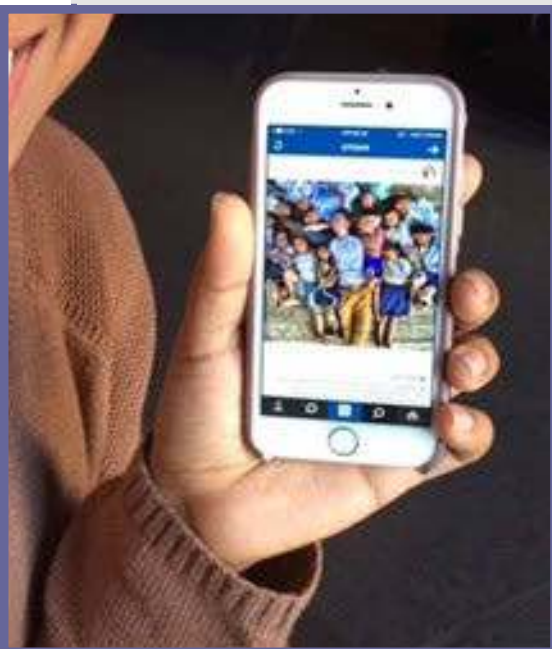
Dos Santos shows a photo from BC’s Instagram page that she found particularly inspiring.