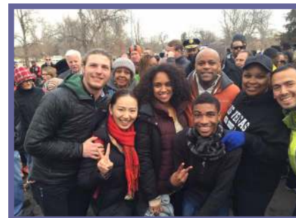
Members of Cast A 2016 pose with Denver Mayor Michael Hancock at the MLK, Jr. Day Parade. Governor John Hickenlooper is sporting the orange and blue Bronco hat in the background.

Cast A 2016 will continue to spread a message of peace and justice as they begin their world tour. Don't miss their premiere show of The Journey on Saturday, February 13 at 7pm at Manual High School (1700 East 28th Avenue in Denver). For more information and to buy tickets, click here .