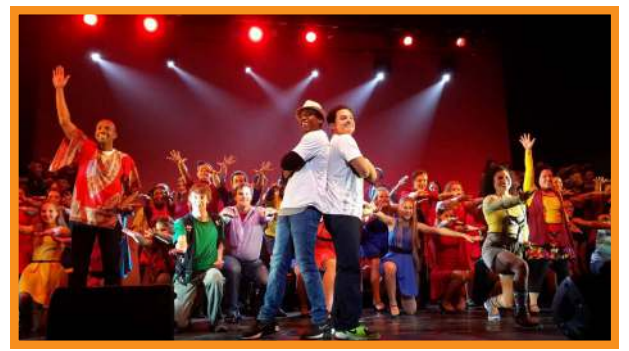
Members of Cast A 2014 perform "Party 'Round the World," a hit song in UWP's current show, Voices.

Since July 2012, audience members around the world have stomped their feet, clapped their hands, and sung along to the sounds and sights of Up with People's (UWP) latest production, Voices. UWP's current cast, Cast B 2014, hits the road in August, and will be the last cast to perform the show before it is locked in the UWP vault. Have you seen Voices? Check out Cast B 2014's tour schedule to relive the excitement again in a tour city near you. If you have not seen Voices, here are ten reasons why you should purchase your ticket today: