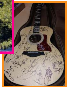
This year's gala boasts of fantastic live and silent auction items including a cabin stay in Breckenridge, Colorado; a guitar signed by over 15 major country artists including Tim McGraw, Lady Antebellum, and Garth Brooks; and a Kenyan safari. Pre-bidding will be available soon.