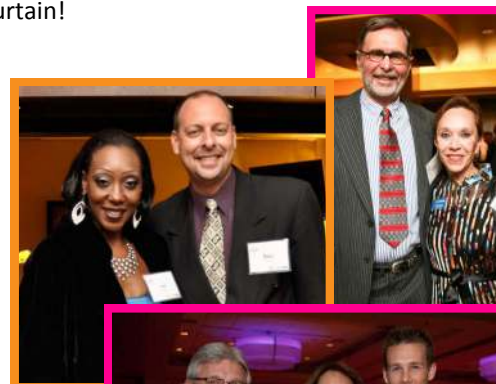
UWP alumni and friends from around the world have attended galas in the past.

mluebke@upwithpeople.org or at 720.215.3219. To receive the UWP group rate at the Denver Marriot City Center of $149 for the night of event, please click here or call 1.877.303.0104. Get your tickets today so you can see a historic glimpse behind the curtain!