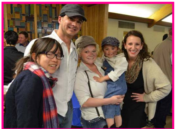
Members of UWP's road staff (top, middle) dressed in era clothing. Host families also dressed up to greet Cast A 2014 (bottom).