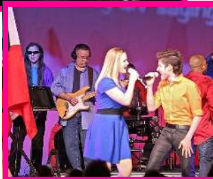
Up with People's 2014 Gala will include live entertainment and the opportunity to bid on great live and silent auction items.