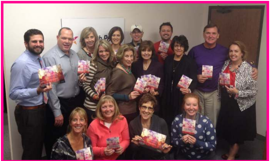
Members of the Host Committee for Up with People's 2014 Gala hold up invitations to the event. Tickets are selling fast and are available by clicking here .

Dig out your show costume and pack your suitcase! You are about to receive a backstage pass to Up with People's 2014 Gala: A Glimpse Behind the Curtain presented by Coldwell Banker Residential Brokerage on Saturday, April 26th at 6pm at the Denver Marriott City Center. While you are not likely to leave the ballroom of the hotel, a ticket will allow Up with People (UWP) alumni to travel back in time to some of the most fun months or years of their lives. If you are not an alumnus of UWP we invite you to attend and experience the sights, sounds, and impact of an organization changing lives around the world.