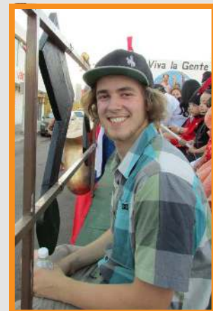
Cast B 2013 had the opportunity to ride on a float in a parade in Mexico.

I am excited to do another semester with Up with People but when I get home, I am looking forward to sharing my experiences from the cultures I have visited, especially the Native American culture.