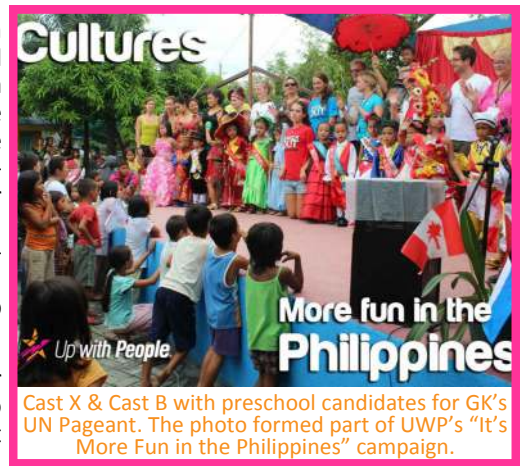
Cast X & Cast B with preschool candidates for GK's UN Pageant. The photo formed part of UWP's "It's More Fun in the Philippines" campaign.

Go to page 8 to read a testimonial from a Cast X participant!