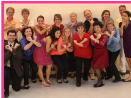
Cast X members and staff during show day.

We spent the next days at GK Baseco participating in classroom activities for the kids mostly focused on activities that required the children to speak in English (which was a specific request made by the regular GK Baseco teachers). We watched the children rehearse for the upcoming UN Day celebration, did more clean up in the GK community, and enjoyed some more fun time with the children. We also took one memorable walk around the Baseco Compound slum where the GK Baseco community is located. And it was in that walk that I encountered the slum conditions I had been expecting. We finished our time with a large community celebration and pa-