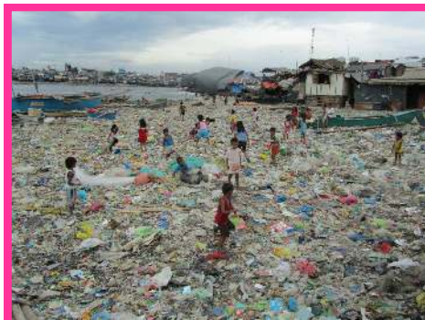
An area in the outskirts of Baseco.

For those who may be looking for a way to make a positive impact in multiple countries around the world I would encourage you to check out Gawad Kalinga. They are truly "Building communities to end poverty." I also feel that Up with People is a great organization that continues to succeed at being a force for good in the world.