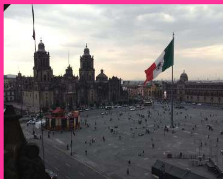
The Zócalo - where Cast B 2012 performed on November 4, 2012.

The timing of the show insured a crowd at capacity, as the date coincided with the weekend Día de los Muertos (Day of the Dead) celebration. Millions of people are on vacation during this week and come to Mexico City to celebrate. More than 5,000 Viva la Gente fans enjoyed the show.