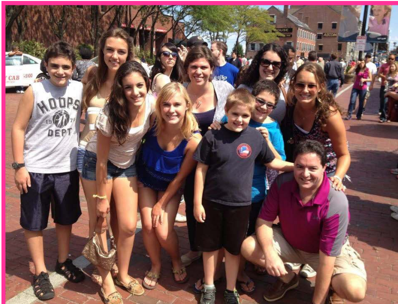
Members of Cast B 2012 with their host family of multiple weeks in Massachusetts

fact it's almost like coming home, and that's what the state and people of Massachusetts have given to Cast B 2012. Through our host families, we have been able to, for a brief time, call this place home, and it's a marvelous feeling.