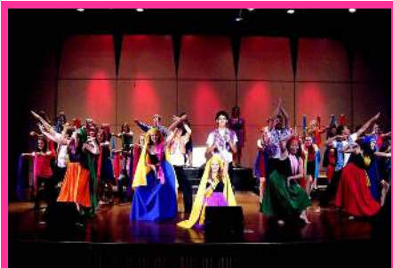
Camp Up with People campers performing Jai Ho

Now you're thinking this is UWP....right? Well....it is...kind of....just the next generation. This is what our program looked like this summer at Camp Up with People , with campers aged 13 to 17 when we performed Jai Ho at one of our public shows.