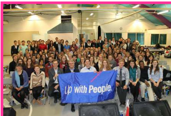
Cast A in Eskilstuna with the sponsors, beneficiary and Eskilstuna Mayor!

the wonderful people the cast has met, and the beautiful mark that we have been able to leave in each community, have been immensely more rewarding than any vacation could ever be. Although we have slept little and worked much, we are leaving Europe feeling that we have received more than we have given.