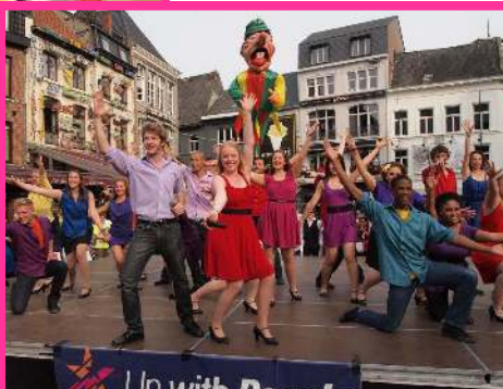
Cast A performing a mini show in Hasselt, Belgium.

Our cast has earned every bead of sweat that has dripped from our brows in each show, every yawn, and every smile that we have evoked on the faces of others who see us doing well in the world. Still we leave Europe