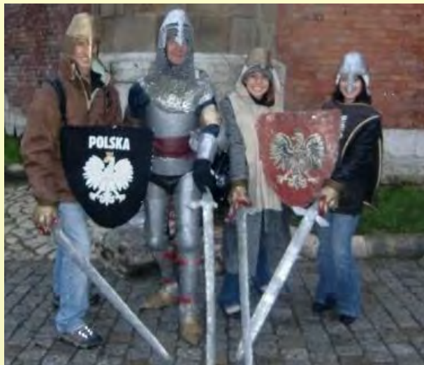
CAST MEMBERS PRACTICE JOISTING IN POLAND

After another successful event day the cast headed on to Zabrze. Upon arriving, the cast had a two hour session discussing per-