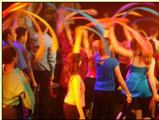
Performing Jai Ho at Opening Session

Probably my favorite sound of the first week of staging comes from the lunchroom on the 1st floor. This is truly where connections and friendships are being made. I've had great lunches with some amazing students and I know that what I've seen is being shared with the entire cast. It's going to be an adventure watching this cast grow and learn as their semester continues!