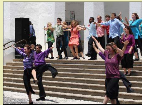
Performing at City Hall, Hamilton, Bermuda

Although Mother Nature was unable to spoil our community impact projects, she did her best to dampen our full performance that was to be held at the beautiful Snorkel Park Beach Resort with torrential rain and heavy winds. Luckily, that did not stop us from getting a few preview performances in before-