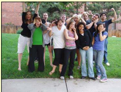
One of Cast B 2009's Home Teams

ballroom on the 2nd floor you can hear the harmonies in Shosholozza , a South African song, during a vocal workshop. An hour and a half later you can watch the cast learn the dance to the new opening number, Sing Your Song . It is so exciting to be involved in the production of this show because of the new and different moments that this cast will perform. The opening number is such a display of raw emotion and joy that it's almost impossible to not be caught up in the moment. The growth in the performing arts that I have seen from this cast just in the first week is absolutely incredible.