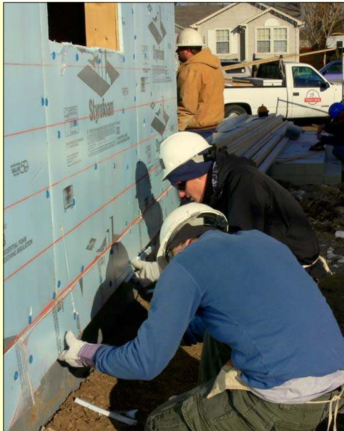
Two members of Cast A 2008 of work on a Denver Habitat for Humanity construction site. All ticket sale proceeds from the February 9th Denver Premiere show will be donated to Metro Denver Habitat for Humanity.

The cast recently participated in its first day of community service in Denver, during the third week of January. For some, this was their first volunteer experience.